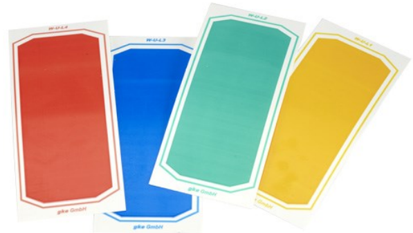
Fig. 2: Test sheets for ultrasonic baths

It is recommended to use these indicators at least once a day in every process used to ensure that there are no changes of the process parameters. It is also recommended to monitor each batch where loads are difficult to clean.